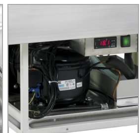
Automatic evaporation of defrost water