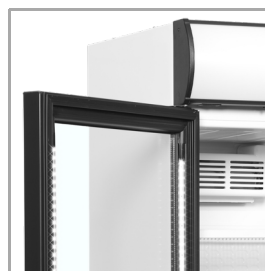
LED light inside door frame